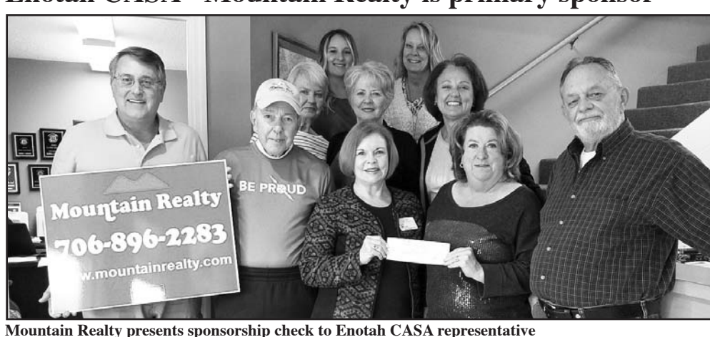
Mountain Realty presents sponsorship check to Enotah CASA representative

Pickleball Association announced it will host a pickleball tournament to benefit Enotah CASA and their advocacy for the abused/neglected children of our community. The event will be held on June 30th and July 1st from 8 AM to noon at the Towns County Pickleball Courts. All interested parties are urged to come out and enjoy the fun, while supporting a good cause.